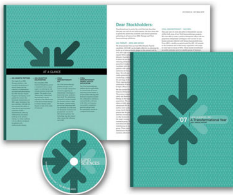
Lipid Sciences 2007