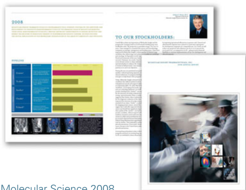
Molecular Science 2008